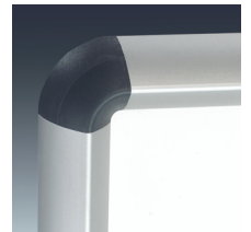
Shield® Design Aluminium frame