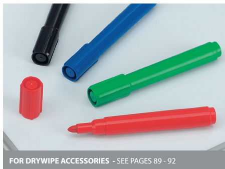
FOR DRYWIPE ACCESSORIES - SEE PAGES 89 - 92