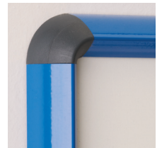
Shield® Design Coloured frame