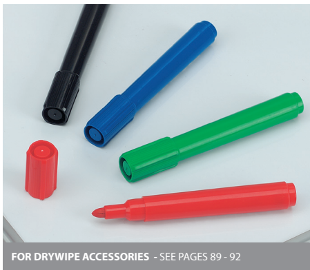
FOR DRYWIPE ACCESSORIES - SEE PAGES 89 - 92

Vitreous Enamelled Steel surface is accepted as the ultimate drywipe surface. The enamel coating is baked at over 800°C, giving it a durable hardwearing surface that we guarantee for 25 years use. The surface also has the advantage of accepting magnets to affix maps/charts, prepared notes and posters. Aluminium framed boards are available in a choice of 8 popular sizes, and supplied with pen tray and concealed through the corner fixings. Larger boards have additional centre supports.